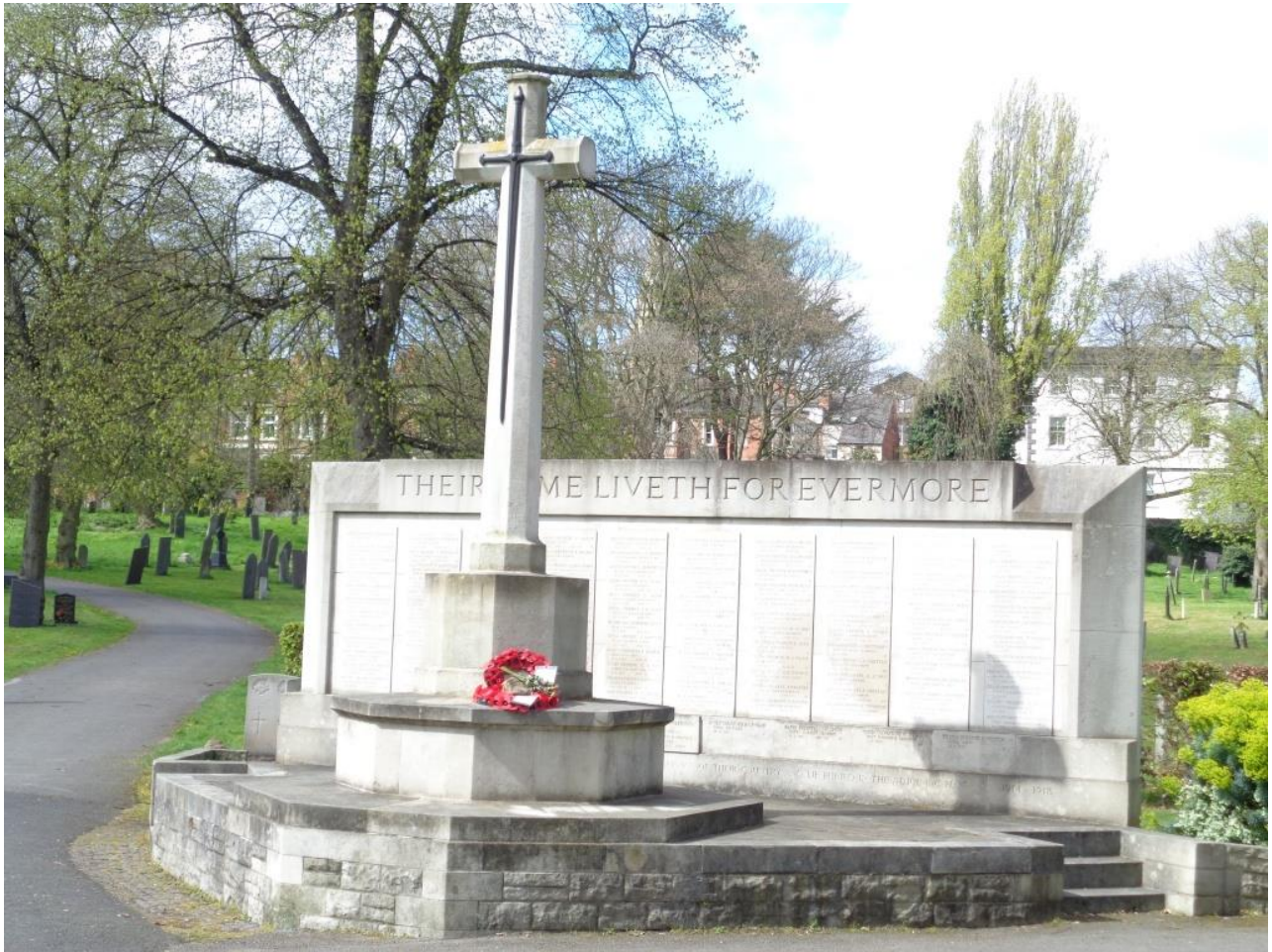
Nottingham General Cemetery – above showing Cross of Sacrifice & Screen Wall